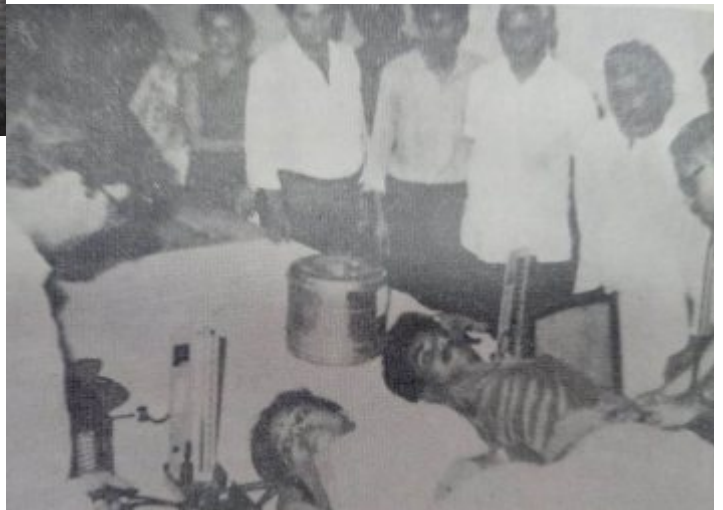
Volunteers Donating Blood, November, 1988