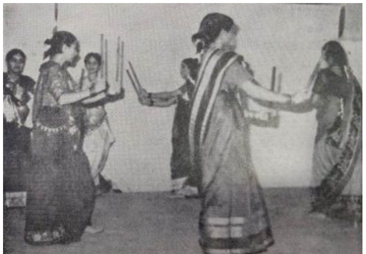
Ladies Club organized a children variety programme, November, 1988