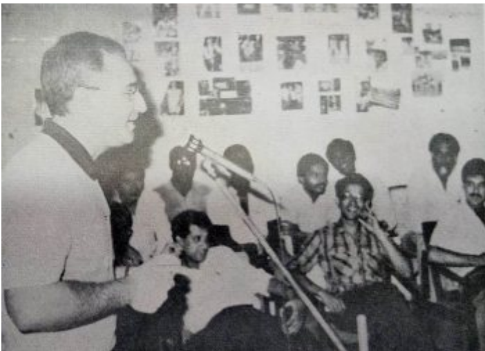
Get together of foreign students, November, 1988