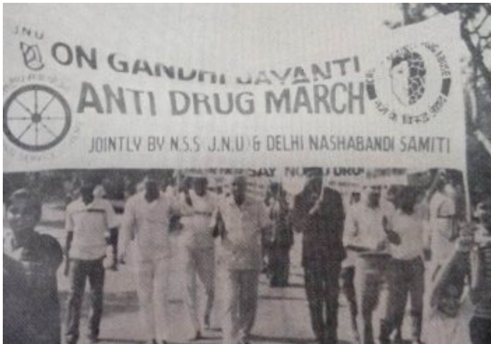
Anti Drug March on Gandhi Jayanti Day, November, 1988